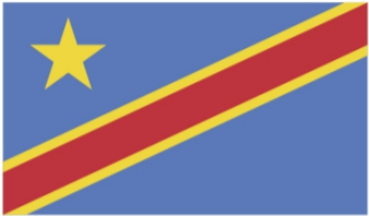
Democratic Republic of the Congo